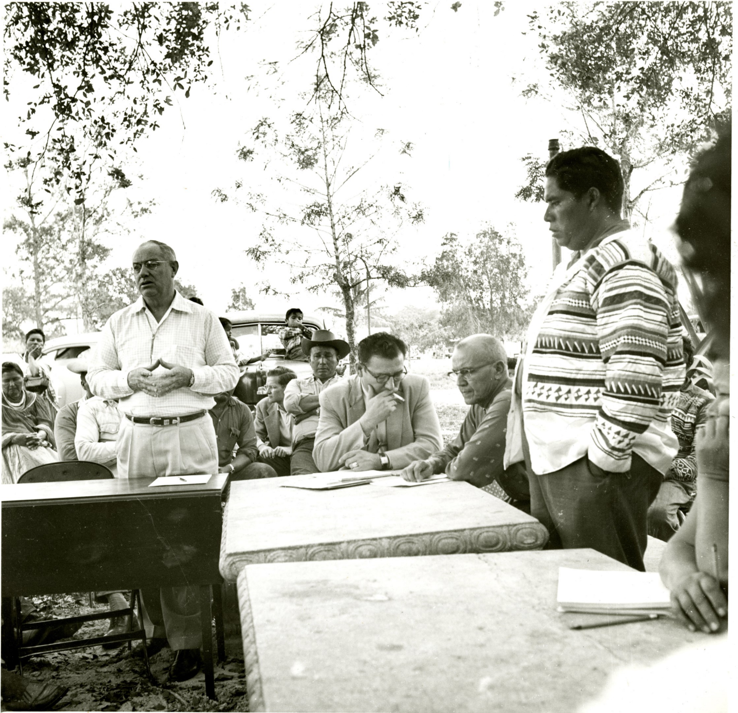
The Constitution and Charter meeting on the Dania (now Hollywood) Reservation meeting under the Council Oak Tree, a live oak. This was part of a series of meetings on the reservations to develop and vote on the Seminole Tribe of Florida's Constitution.