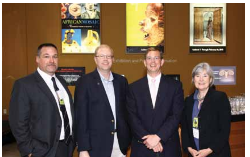
Three Affiliates sent staff members to participate in Smithsonian Teacher’s Night in Washington, D.C., in September 2012.