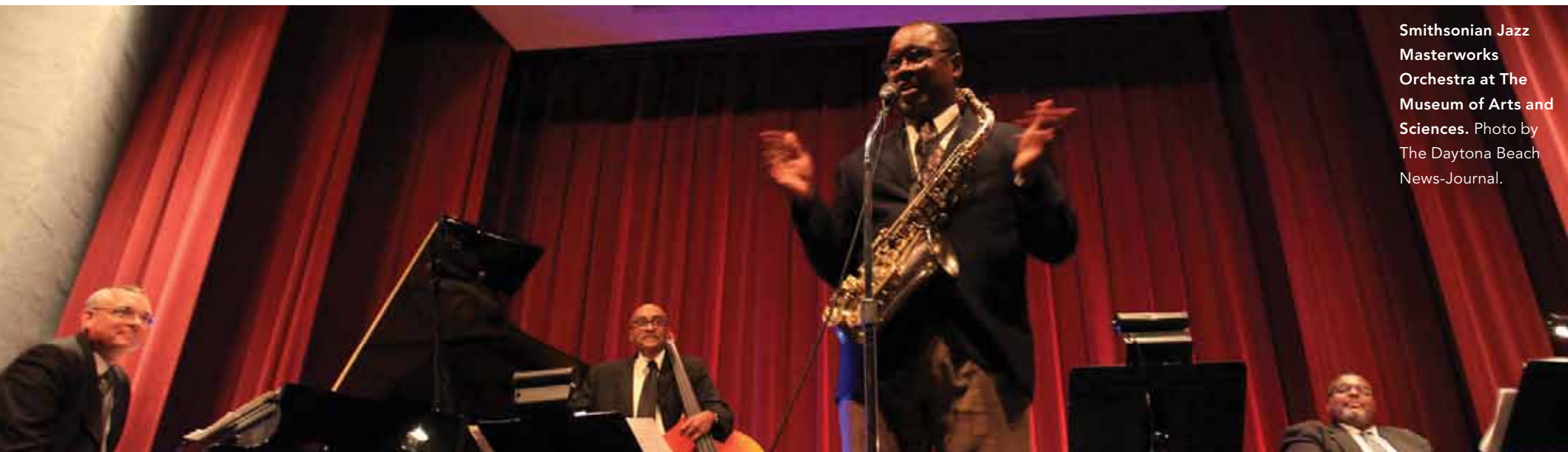
Smithsonian Jazz Masterworks Orchestra at The Museum of Arts and Sciences.