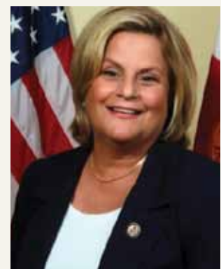
Ileana Ros-Lehtinen (R-FL)