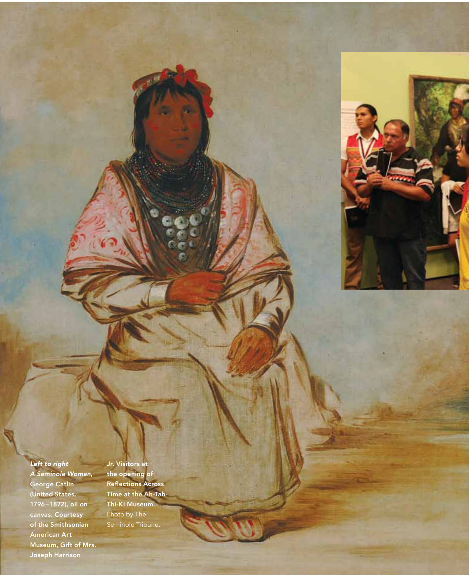
Left to right A Seminole Woman , George Catlin (United States, 1796–1872), oil on canvas. Courtesy of the Smithsonian American Art Museum, Gift of Mrs. Joseph Harrison